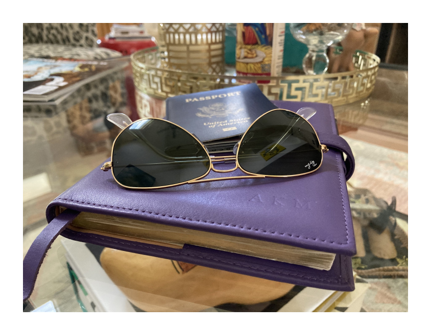
Austin, TX | 2022

I had a compelling conversation with a dear friend not too long ago.