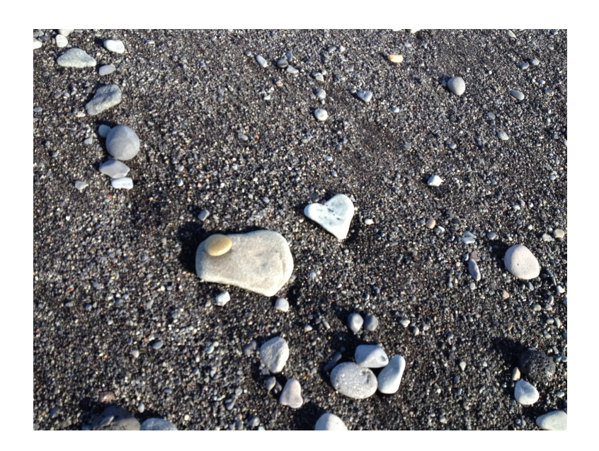
Iceland | 2015

My heart aches as we watch yet another humanitarian crisis unfold. As I struggle to find words to articulate what I am feeling, the concept of leadership plays like a violin in the dark.